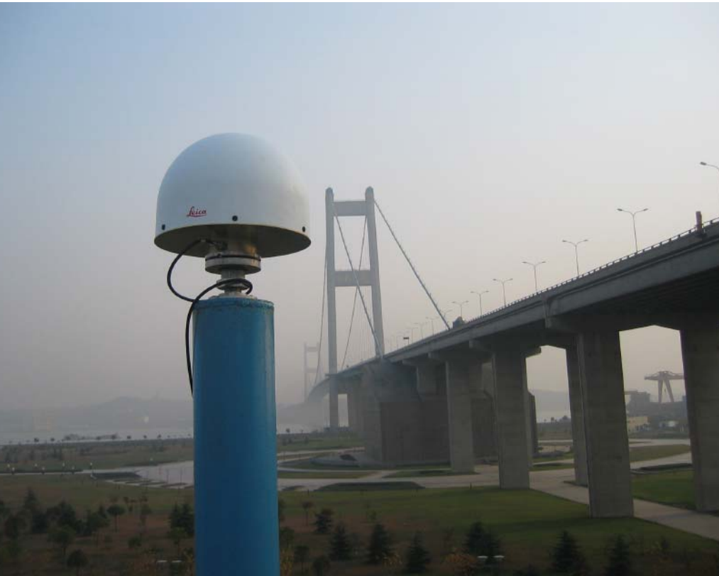
Jiangyin Bridge's GPS monitoring reference station

In recent years, GPS RTK technology has been used by more and more bridge operation and management facilities in dynamic bridge displacement monitoring. Also GPS is playing an increasingly important role in high precision positioning projects, such as structural health status and ground motion monitoring. In 1999, the world's first GPS-based bridge monitoring project was deployed by Leica Geosystems on the Tsing Ma Bridge, Hong Kong. After that, Leica Geosystems' software and hardware have been deployed to monitor bridge structural health of numerous