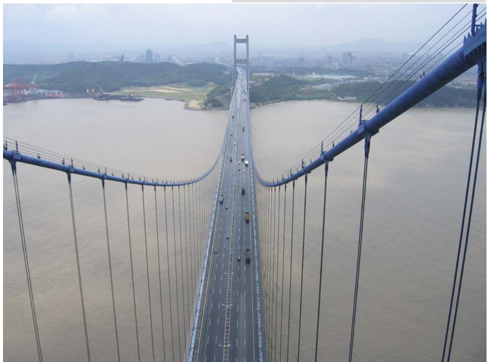
The Jiangyin Yangtze River Highway Bridge is the longest steel boxgirder suspension bridge in China