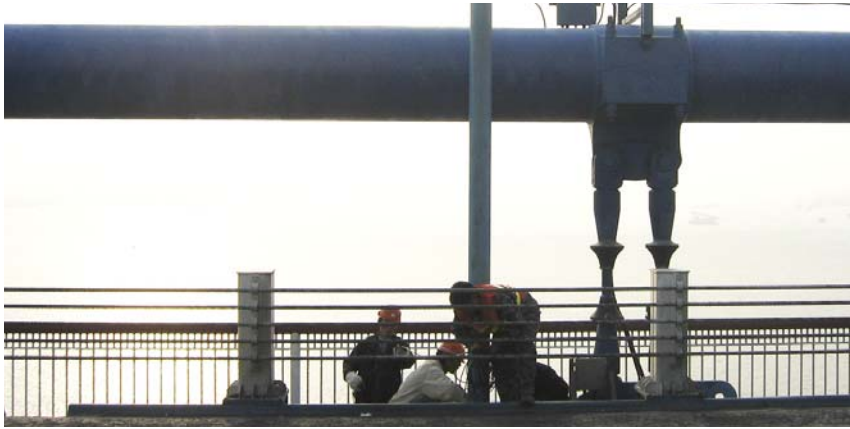
Installation of the bridge monitoring system on Jiangyin Yangtze River Highway Bridge.