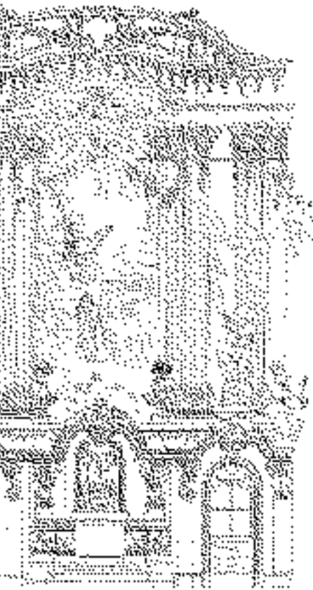
Reconstruction of the view of the altar according to stereo evaluation of historic photographs

geometric references (eg., differences in height and evenness).