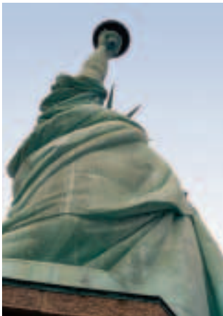
Above: Frog's eye view of the Statue of Liberty. Most of the scans were taken from the base of the statue and a few from the top observation balcony.

State-of-the-art Cyra laser-scanning technology was adapted to quite an extraordinary task recently when it was used to document the detailed surface geometry of New York's most famous landmark – the Statue of Liberty. Traditionally used in the industrial plant and civil infrastructure fields, laser scanning's ability to capture highly detailed, 3D surface geometry of large structures made it a good match for the complex geometry of the Statue of Liberty.