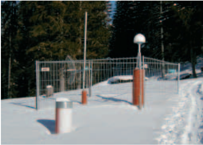
(Above): Permanent GPS station with Wireless-LAN antenna after completion